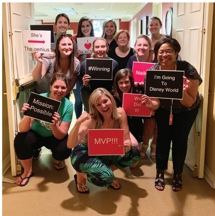
This new member group had a great time creating inspirational, motivating signs at one of their meetings!